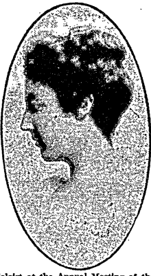
Soloist at the Annual Meeting of the Y. W. C. A. Wednesday Evening.

In the case of the other Reyner Memorial attractions, few large parties were given; but for numerous little groups of three, four or five a dinner preceded or a supper followed the entertainment.